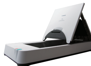
A4 Flatbed Scanner unit 101