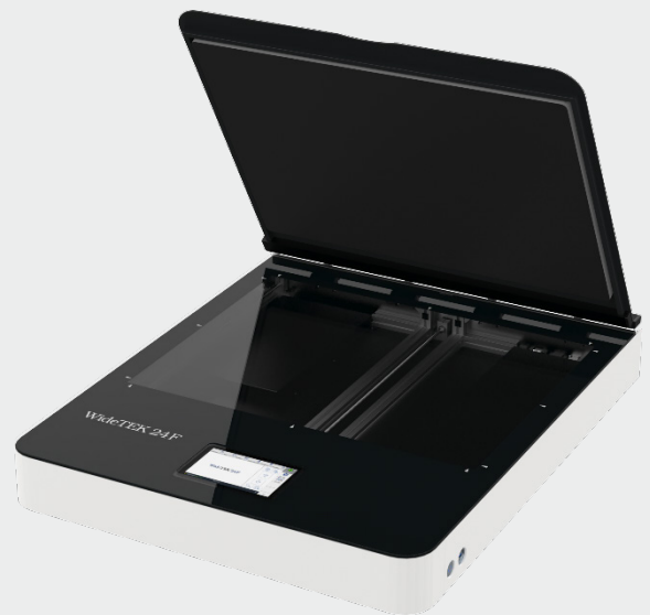
Scratch resistant glass plate enables scanning oversized originals