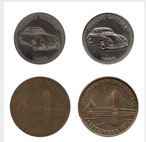
2D scan versus 3D scan, capture all details