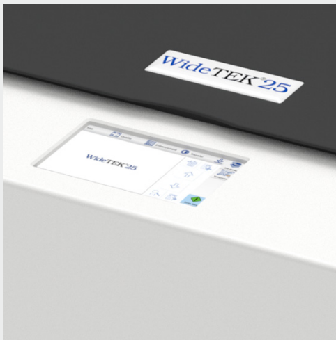
Large color touchscreen for simplified operation